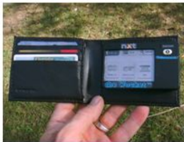
Wocket™ prototype Not an Actual Product

We believe that many credit card holders either do not possess a smartphone or will be reluctant to use their smartphone for mobile payments. Nxt-ID is in the process of developing a separate physical electronic wallet that is intended to hold information from credit cards, identification cards, and virtually any card to allow a specific owner of the card to configure a single electronic card to replicate any of the copied cards and thereby reduce the number of cards a user must carry. As designed, users will simply scan in each card and take its picture, front and back, slide through each of the scanned "soft-cards" via a display and select the card that the user wishes to program the mCard (multi-Card). The resultant electronic card can then be swiped just like a regular credit, debit, or virtually any other card. The system consists of 2 devices: A card reader/writer "wocket" and "mCard". The e-wallet will be secured by biometric identification and will be compatible with the emerging standard for Near Field Communications (NFC). The Wocket™ has completed the design stage and prototypes are currently being fabricated.