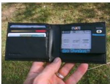
Wocket™ Prototype – Not an Actual Product

Our initial development product will be the MobileBio Wocket™ . Many credit card holders either do not possess a smartphone or will be reluctant to use their smartphone for mobile payments. Furthermore, physical credit card terminals requiring a card swipe will remain the most common point of sale terminal for foreseeable future. As a result, Nxt-ID is focusing its initial efforts on a product that is a separate physical secure electronic wallet that holds information from credit cards, identification cards, and virtually any other card to allow the owner of the card to configure a reprogrammable single electronic card housed in the wallet to replicate any of their cards thereby reducing the number of cards they must carry. The resultant electronic card can then be swiped just like a regular credit card. The e-wallet will be secured by a biometric identifier as well as other layers of security and will be compatible with the emerging standard for Near Field Communications (NFC) and other touchless payment methods. Our current plans call for the launch of this product during the second half of 2013. We intend to pursue partnerships with financial institutions to launch this product although we do not yet have any existing relationships with potential partners.